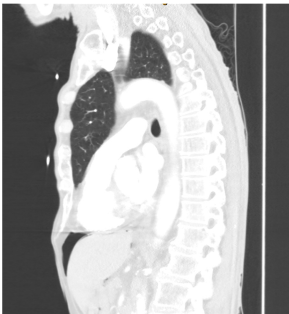
Fig. 2. The patient was asymptomatic despite the pneumoperitoneum.

with no apparent distension. There were no signs of peritonism. He had a reducible, non-tender left inguinal hernia. His WCC was 12 \times 10^9/L ( >11 \times 10^9/L ) and CRP was 10 mg/L ( >5.0 mg/L). ECG showed sinus tachycardia and his CXR did not show any obvious consolidation. He was treated as an infective exacerbation of COPD, with antibiotics, bronchodilators, and chest physiotherapy. He subsequently had a CTPA to rule out a pulmonary embolus which showed a moderate amount of intraperitoneal free gas in the upper abdomen (Figs. 1 and 2).