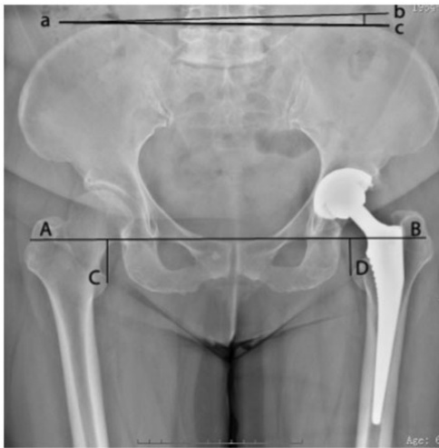
Figure 2. Anteroposterior image of a patient illustrating how the PO and anatomical LLD are measured. A line connecting the iliac crests was drawn (ab), and another line was drawn along the bottom of the fourth lumbar vertebra (ac). The angle between ab and ac was measured as the PO angle. The trans-tear drop line was drawn (AB), the tip of lesser trochanter was marked (C,D), and the difference in perpendicular distance between CAB and DAB was the LLD. PO, pelvic obliquity; LLD, leg length discrepancy.

Functional improvement of HHS scores was analyzed using the Wilcoxon test and