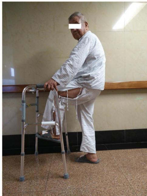
Figure 1. A 60-year-old patient completed the gait training program with a walker.

All of the patients scheduled for THA were trained to use the walker under the guidance of one well-trained doctor the day before surgery because it is easier to learn how to walk pre-operatively than immediately after a THA. All patients took part in the true gait training program 24 hours after the operation. After the surgery, isometric contraction of the quadriceps muscles was encouraged immediately, and full weight-bearing was allowed starting the day after surgery with a walker in all cases. Patients were stood upright to ensure vertical alignment of the body and avoid angulation towards the non-operative side. After moving the walker one step, patients raised the non-operative leg, kept the knee flexed to 90 degrees and held it for 3 seconds, then moved the walker another step, raised the operative leg, and kept the knee flexed to 90 degrees and held it for another 3 seconds (Figure 1). Patients repeated this cycle 20 to 30 times during every training procedure. It is essential to ensure that the patients maintain a vertical posture and avoid inclining towards the non-operative side in both the standing and walking phases. All patients took part in the walking rebuilding program 3 to 6 times every 24 hours during their hospitalization. One month after surgery, patients were encouraged to practice without the walker and to climb stairs 6 weeks after THA under the guidance of the doctor.