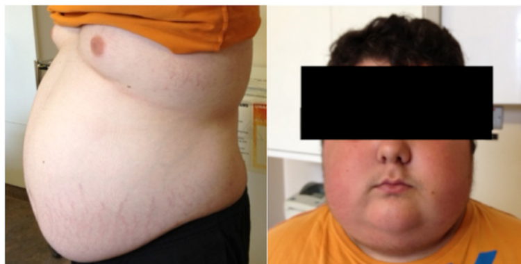
Fig 1 Pictures taken the week prior to surgery, demonstrating increased abdominal circumference, striae, and Cushingoid facies

syndrome. A peripheral human corticotropin-releasing hormone (CRH) test showed a greater than 50 % rise in ACTH after 15 min, (60.1 pg/ml at 0 mins rising to 104 pg/ml at 15 mins), along with an almost 50 % rise in cortisol (756 to 1126 nmol/L). This is highly characteristic of pituitary dependent Cushing's syndrome (Cushing's disease) [4]. A contrast-enhanced dynamic pituitary MRI scan was performed, and interpreted by a specialist pituitary neuroradiologist. This revealed a radiologically normal pituitary gland.