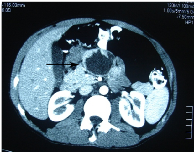
Figure 1: Photomicrograph of the arterial phase CT showing well-circumscribed low attenuated lesion (arrow).