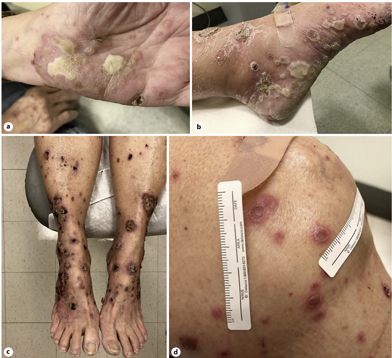
Fig. 1. Different clinical morphologies. Tense bullous lesions on palms (a) and soles (b). c Large hyperkeratotic nodules and plaques, some with central ulceration. d Pink flat papules with white peripheral border, some with scale.

appearing 3–6 months after initiating the anti-PD-1 agent [5]. A delayed effect of immune checkpoint antibodies, as seen in our patient, can also occur sometimes up to 1 year after the initiation of anti-PD-1 treatment, so keeping a high clinical suspicion for anti-PD-1 cutaneous toxicity is essential [6]. To our knowledge, the concomitant manifestations of lichenoid processes, including LP-like lesions, keratoacanthomas, and bullous LP, in an individual patient have not been reported.