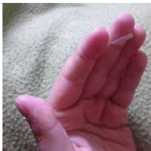
Fig. 2. Magnetic resonance imaging shows orbital cellulitis and sinusitis.