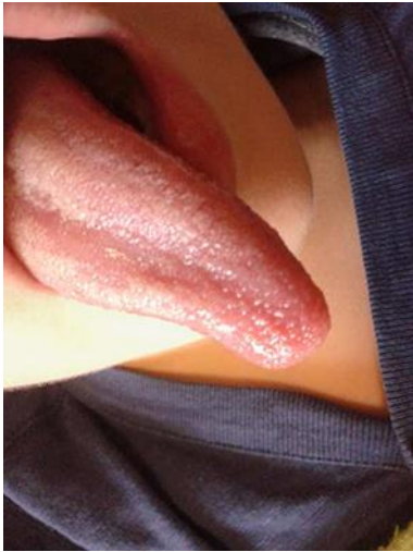
Fig. 3. Periungual desquamation in the subacute phase of KD.