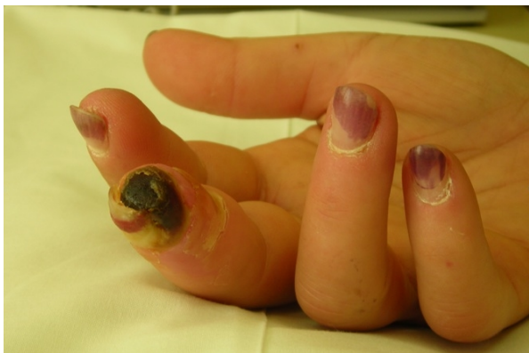
Figure 1 A photograph of the symptomatic hand demonstrating digital gangrene. The fingernails are discolored from the presence of residual 'gel-nails'.

drome B and anti-ribonucleoprotein antibodies (anti-SSA, anti-SSB, anti-RNP), anti-Sm, anti-Scl-70, antineutrophil cytoplasmic antibodies, anticardiolipin antibodies, cryoglobulins, C3, C4, C-reactive protein, complete blood count, electrolytes, creatinine, hepatic transaminases, alkaline phosphatase and urinalysis were all normal or negative. Associated underlying pathology including cardiopulmonary, gastrointestinal and renal involvement were excluded through cardiology consultation, chest radiograph, echocardiogram, pulmonary function testing, high-resolution computerized tomography (CT) of the chest, 24 hour urine for creatinine clearance, serum chemistry and urinalysis, barium swallow, and CT abdomen and pelvis.