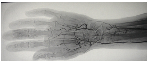
Figure 2 Angiographic image from the right distal upper extremity demonstrating poor distal flow.

In hospital she was initiated on clopidogrel bisulfate, pentoxifylline, topical nitropaste, a two week trial of prednisone, a seven day course of clindamycin and morphine for pain control. Nifedipine was later initiated as an out-patient. Gradually over the next two months the necrosis resolved with minimal tissue loss at the digit tip. She continues to be followed in the rheumatology out-patient clinic with periodic evaluations for potential evolution of connective tissue disease and in cardiology clinic for follow-up of her WPW.