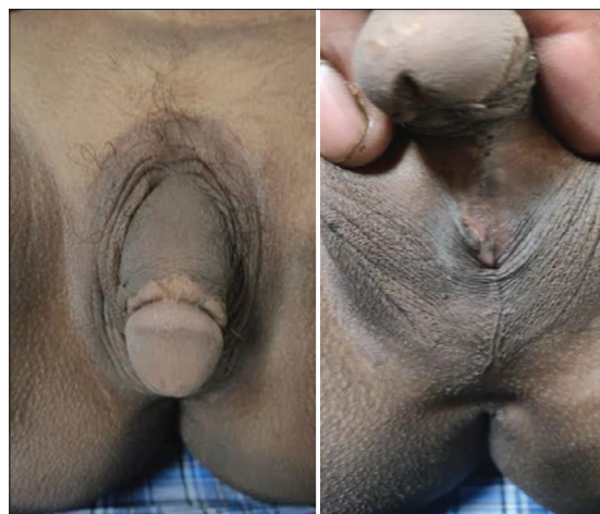
Figure 1: External genitalia

MGD is a chromosomal disease characterized by mosaicism with a karyotype ranging from 45,X/46,XY (classical form) to 45,X/47,XYY or 46X/46,XY/47,XYY. The phenotype includes women with or without Turner's stigmata to men with or without ambiguous genitalia. Internal ducts may range from the presence of Müllerian ducts and/or Wolffian ducts and