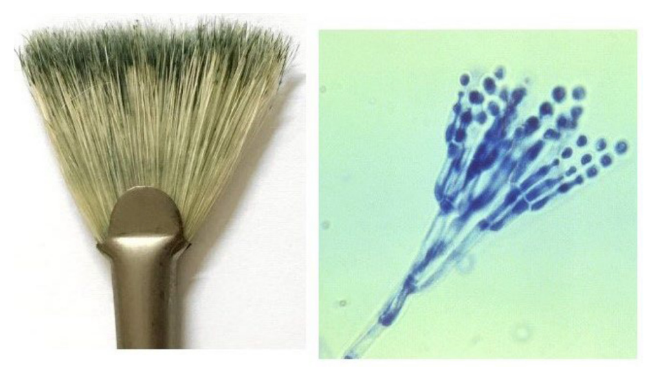
Fig. 1. Shows the arrangement of phialides and conidia of penicillium fungus on the right side which looks like a paintbrush shown on the left.