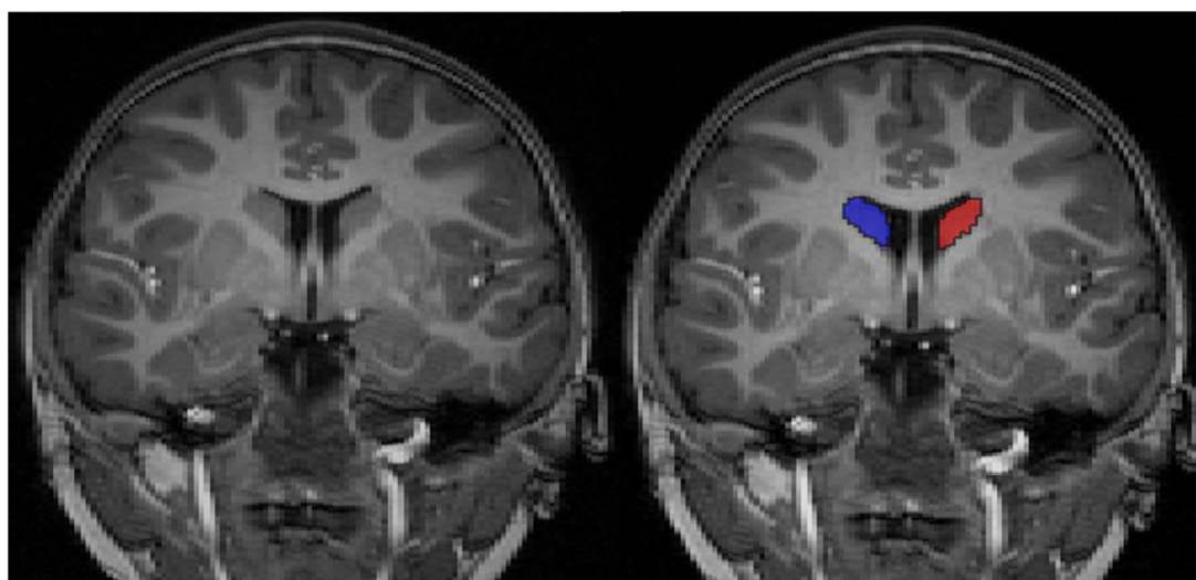
Fig. 1. Caudate nucleus (left/right) in the coronal plane is shown in blue and red. (For interpretation of the references to color in this figure legend, the reader is referred to the web version of this article.)

Intracranial volume (ICV) was determined from the T1-weighted MRI images using an automated method within Freesurfer ( http://surfer.nmr.mgh.harvard.edu/ ), an automated parcellation program. Briefly, Freesurfer is a fully automated method used to process talairach alignment, intensity normalization (Sled et al., 1998), removal of skull and non-brain tissue with a hybrid watershed/surface deformation procedure (Segonne et al., 2007), automated Talairach transformation, and segmentation of the subcortical white matter and deep gray matter volumetric