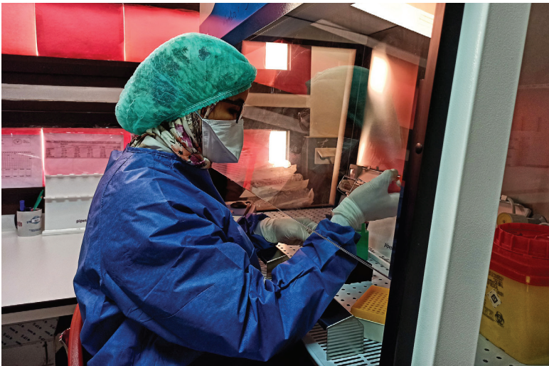
Photo: Laboratory technician performing immunological analysis related to COVID-19 at the University Hospital of Marrakech, Morocco (from Brahim Admou's collection, used with permission).

In a frame of an international collaboration, LMIC should be fully supported technically and financially by WHO and other governments, including donations of coronavirus test kits, personal protection tools, and other life-support equipments or, at a minimum, ensuring that African countries are not priced out of the market for these commodities [10].