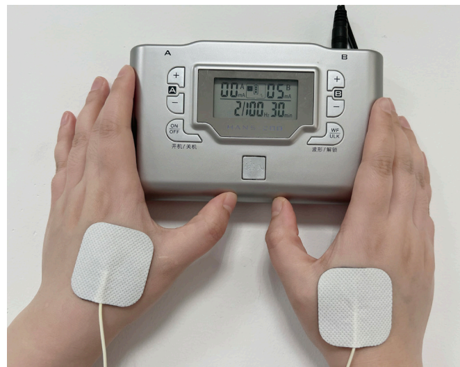
Figure 4 Application of TEAS. TEAS, transcutaneous electrical acupoints stimulation.

course of treatment. 43 44 GAD-7 score (figure 5) ranges from 0 to 21 and score of each item ranges from 0 to 4. An overall score of GAD-7 indicates 0–4 as no anxiety, 5–9 as possibly mild anxiety, 10–14 as potentially moderate anxiety, and more than 15 as probably severe anxiety. 43 Frankly, higher scores suggest more severe symptoms of anxiety. 45