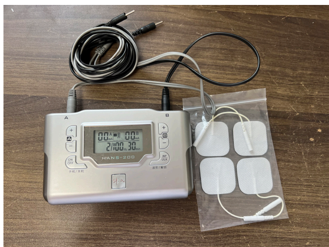
Figure 3 HANS200A.

The primary outcome is the GAD-7 scale change between the day before surgery with the baseline. GAD-7 is a seven-item designed to simply measure or assess anxiety disorders. GAD-7 is a valid and efficient tool which is sensitive to detect change in anxiety-specific therapies over the