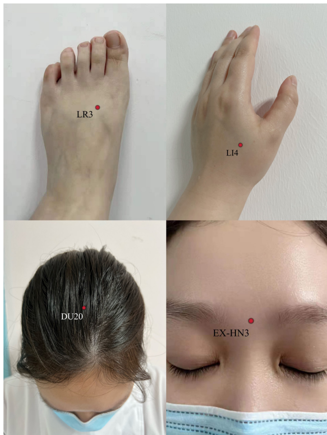
Figure 2 Location of DU20, EX-HN3, LI4 and LR3.

responsible for the operation will tell patients in STEAS group that this is a type of stimulus without perception.