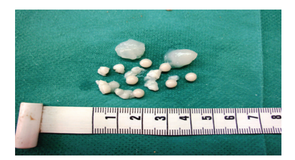
FIGURE 1: Macroscopic appearance of the extruded mucin and globules.