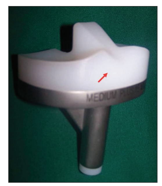
Figure 4: Monoblock tibial component with deep dish design and anterior cut out in insert (arrow) to accommodate the patellar tendon during deep knee flexion