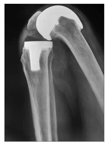
Figure 6: Lateral radiograph of the knee of three year follow up of INDUS knee showing maintaining optimal flexion