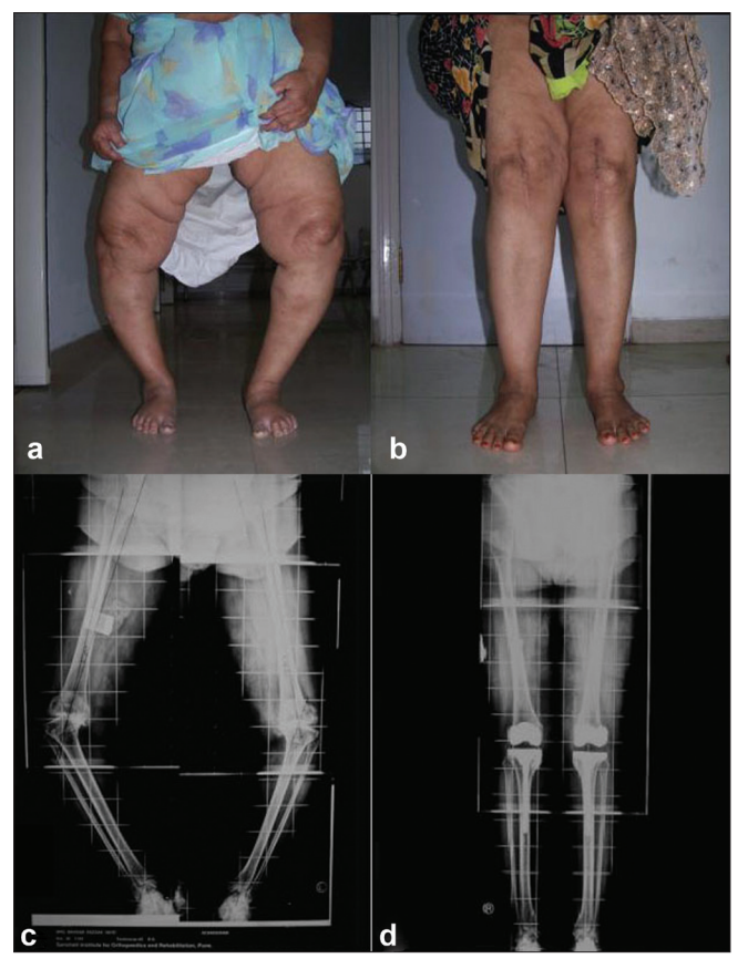
Figure 7: Clinical pre-operative photograph (a) of a 62 yrs old patient with severe genuvarum with OA. Clinical photograph (b) of same patient 30 months follow-up shows good deformity correction. Pre-operative scanogram (c) and post-operative scanogram (d) of the same patient shows good correction

follow-up. Pre-operatively, the mean flexion contracture was 10.3^{\circ} (range, 0-30^{\circ} ), the mean maximum flexion was 114.83^{\circ} (60–140°), and the mean range of movement was 106.2^{\circ} (45–150°). At the last follow-up, the mean flexion contracture was 3.19^{\circ} (0–10°), the mean maximal