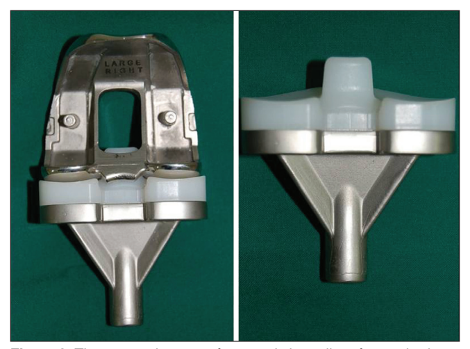
Figure 3: The post and cam conform mediolaterally to form a third joint allowing enhanced rotational congruency