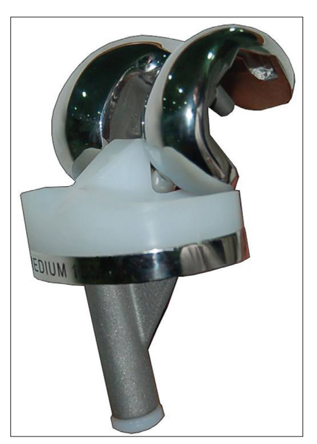
Figure 1: INDUS a posterior stabilized design to increase femoral rollback