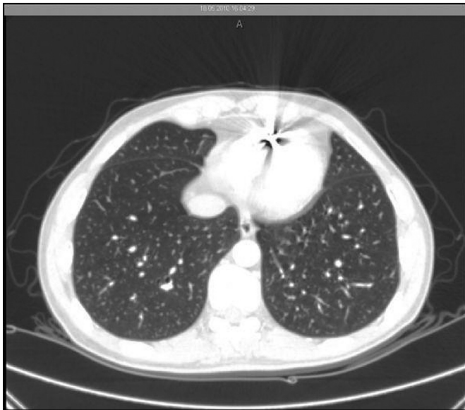
Fig. 3. There is no abnormal radiological finding in parenchymal.

[12]. If insufficient history is taken and has no echocardiography we think diagnosis of pulmonary embolism according to chest pain, fever and torax BT angiography findings and then we can give the patient anticoagulant therapy against antibiotics. Especially in recent years, increased heart battery applications commensurate increase in cases of infective endocarditis. This is when evaluating patients with this aspect should be on the look out. The most frequent infective endocarditis in previous years as a result of venous catheters, valve pathology, recently the pacemaker has begun to take place in etiology.