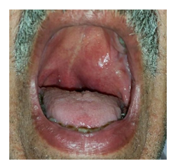
Figure 1. The mass arising from the lateral wall of the left oropharynx.

tonsillar pillar anteromedially was observed (Figure 1). Audiometric tests showed a left mild conductive hearing loss, with type "B" tympanogram. MRI showed a mass of 22 \times 43 \times 56 \text{ mm}^3 arising from the deep lobe of the parotid gland (Figure 2). A fine needle biopsy was compatible with "Warthin tumor." Previous nasotracheal intubation, a standard tonsillectomy position is used. Before oral incision, we isolated the left internal jugular vein (IJV) and the carotid arteries via cervicotomic approach (Figure 3). Under microscope magnification, with a grade of magnification depending on the operational requirements, monopolar diathermy is