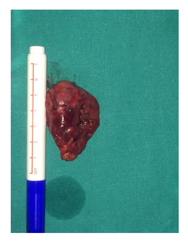
Figure 4. The specimen after surgical removal.

challenging for larger deep-lobe tumors. Access to the CS compartment is also limited.