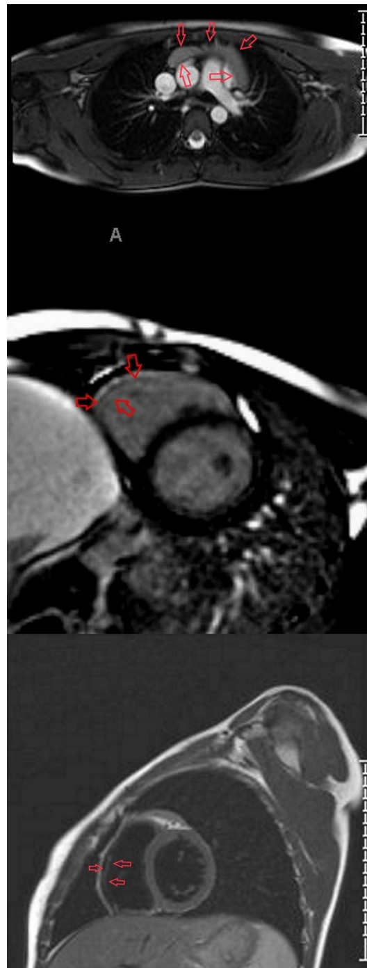
Figure 3 Cardiac MRI. Evidence of myocardial contusion involving the right ventricular free wall with focal areas of delayed enhancement, evidence of oedema (figure 3C), significant regional wall motion abnormalities involving the right ventricular outflow tract and right ventricular free wall (figure 3B). Normal left ventricular size and function, LVEF of 69%; small pericardial effusion with possible pericardial stranding/haematoma (figure 3A); normal right ventricular size with mildly depressed global function and regional wall motion abnormalities as described above. RVEF is 41%. LVEF, Left ventricular ejection fraction; RVEF, right ventricular ejection fraction. Figure 3A, 3B and 3C follow in order.