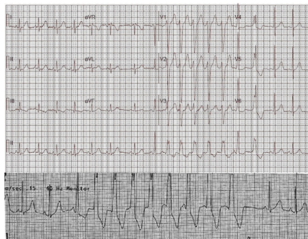
Figure 2 ECG. Monomorphic accelerated ventricular rhythm of LBBB morphology.

Trauma is the leading cause of death in individuals under 18 years of age. Although thoracic trauma only accounts for a small percentage of admissions to a trauma centre, it is second only to head injury as the most common cause of death in this age group. Blunt myocardial injuries range from asymptomatic