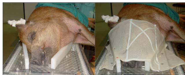
Figure 1. Experimental radiotherapy of the head and neck region in BR-1 Minipigs. A thermoplastic face mask was used for animal immobilization during the radiotherapy sessions.

Radiation is an important tool for both curative and palliative treatment of head and neck cancer. However, despite the beneficial effects of RT on tumor control, the radiation dose to the adjacent normal tissue may cause complications (19). RT for head and neck cancer usually affects the salivary glands, resulting in loss of gland function with reduction in saliva flow and xerostomia as early complications. The loss of saliva flow is a potentially debilitating condition that can permanently compromise oral health and nutrition (13). Radiation-induced xerostomia