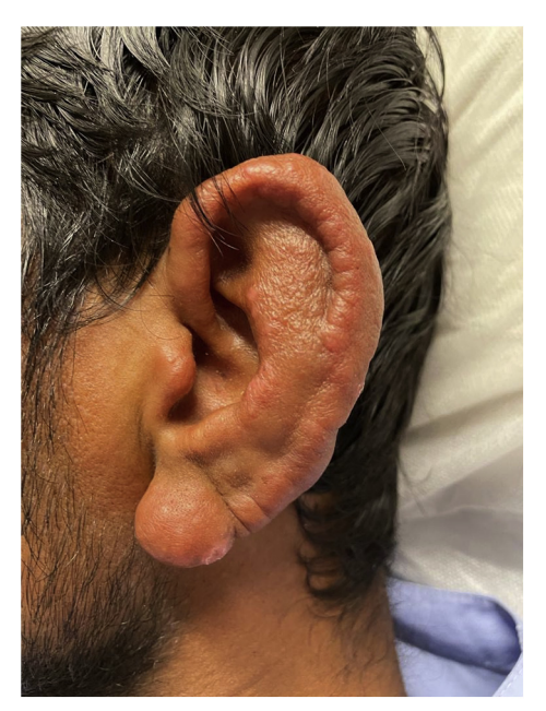
Fig 1. Ear edema.