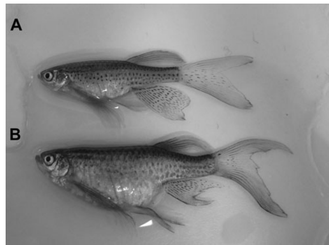
FIG. 1. Example of a descriptive annotation of a zebrafish welfare concern. (A) Normal appearance of zebrafish, (B) female with enlarged abdomen, which would be annotated as abdomen_general_distended .