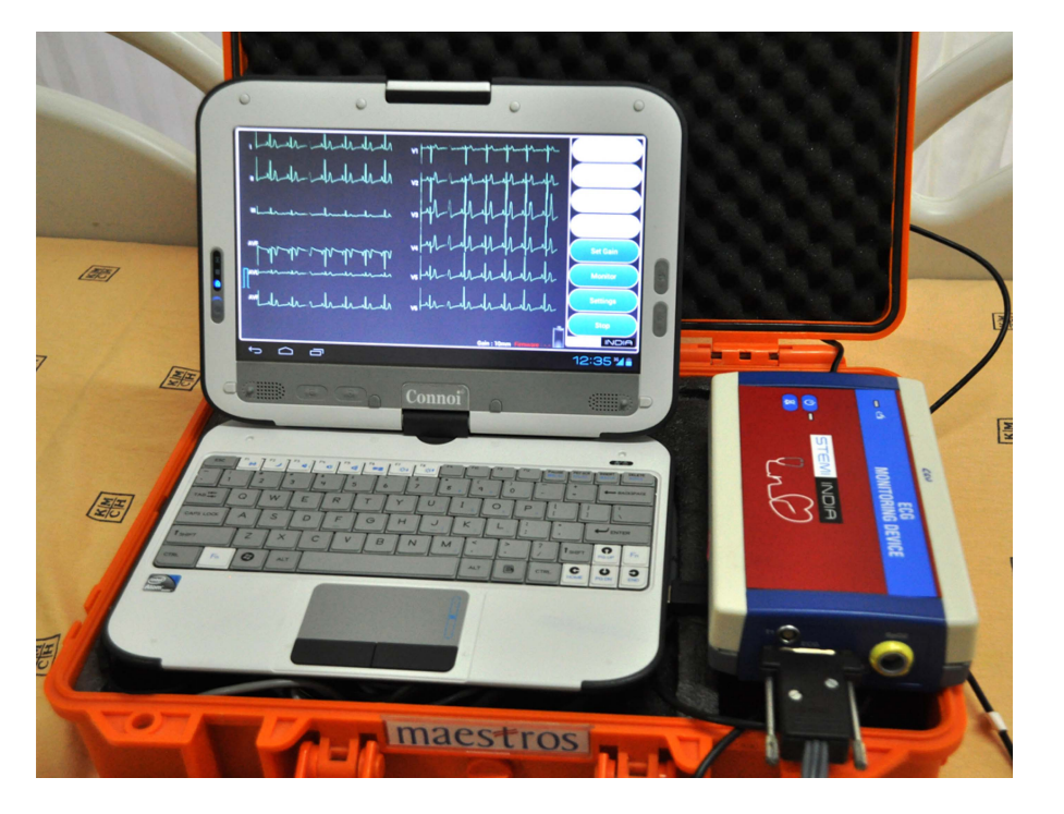
Figure 3 ST-elevation myocardial infarction kit.

The paramedic and STEMI coordinators will capture the patient demographic details along with a checklist for eligibility for fibronolytic therapy. This information along with the ECG will be transmitted to the on-call cardiologist in that cluster to diagnose STEMI and decide on initial treatment. The on-call cardiologist receives an alert once these data are obtained. She (or he) can then go over the patient records, ECG and confirm STEMI. This in turn alerts the paramedic to transport the patient to the destination based on GPS navigation. A dedicated server will be available round the clock to route all information from one hand-held device to the other in ambulance or hospital. Data are simultaneously stored on the server along with the ECG snapshot which can be accessed by teams at the receiving hospital.