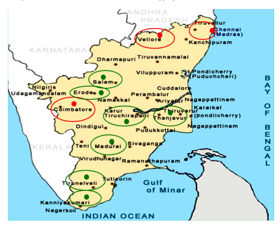
Figure 2 Geographical location of ST-elevation myocardial infarction clusters in the state of Tamil Nadu.

India; to help organise and train STEMI teams in hospitals; and to develop STEMI systems of care appropriate to the context of healthcare systems'