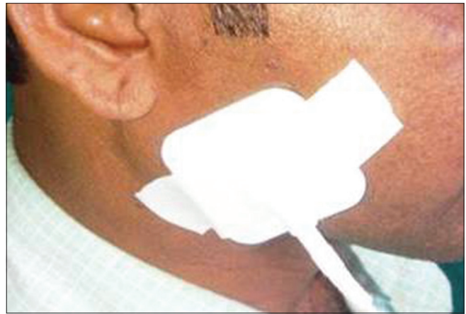
Figure 2: Patient positioned with surface electrode pads of the transcutaneous electrical nerve stimulation unit

Furthermore, in the present study, the subjects included were divided into three age groups, namely 20–29 years,