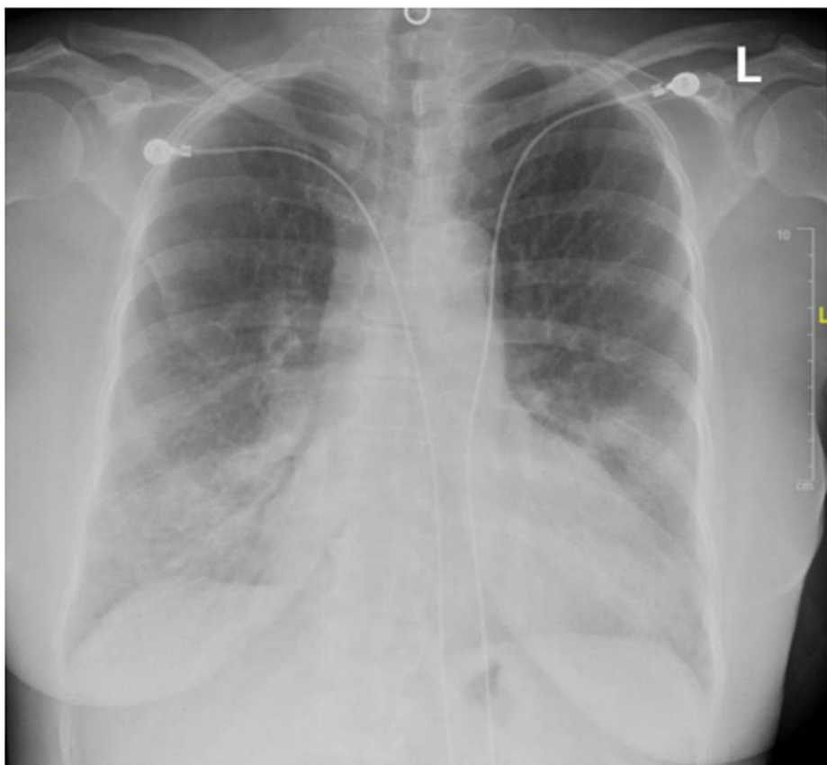
FIGURE 1: Chest X-ray showing bilateral patchy infiltrates

Laboratory testing on presentation reported a leukocyte count of 11.0 k/ul, hemoglobin of 9 g/L, platelet counts of 394,000/mm 3 , an erythrocyte sedimentation rate of 120 mm/hr, C-reactive protein of 28.43 mg/L (ref <5.0), serum creatinine of 4.3 mg/dL and a lipase of 300 U/L. Urinalysis showed large blood and nephrotic range proteinuria (Urine protein to creatinine ratio of 5.6 g/day), SARS-CoV-2 antibodies were positive. A chest X-ray showed bilateral patchy infiltrates (Figure 1).