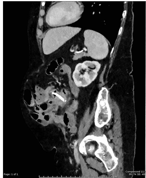
Figure 2: Sagittal CT image showing migrated biliary stent perforation through jejunum located within a large anterior abdominal wall hernia.

The patient proceeded to emergency laparotomy, adhesiolysis, stent removal, small bowel resection and abdominal wall closure. Intra-operative findings confirmed that the biliary stent had eroded through small bowel within the large incisional hernia and into the anterior abdominal wall (see Fig. 3). Histopathology of the resected small bowel demonstrated mucosal ulceration, with a granulation tissue lined tract extending to the serosal surface consistent with perforation. The patient progressed well but slowly in the post-operative period with a prolonged post-operative ileus and issues with fluid balance. She required a 5-day intensive care admission in the context of respiratory distress secondary to fluid overload. During this time, she was also commenced on parenteral nutrition due to prolonged ileus