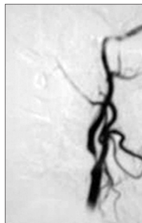
Figure 2: Digital subtraction angiogram shows severe stenosis at origin of right internal carotid artery

MRI of brain showed acute infarct in left MCA-PCA watershed territory [Figure 4]. The MRA of brain and neck was normal. Carotid Doppler ultrasonography and transthoracic and transesophageal echocardiography were normal. Hemogram and metabolic profile were normal. Vasculitis and antiphospholipid workup was negative. Prothrombotic workup could not be done due to financial constraints. He is on aspirin and atorvastatin.