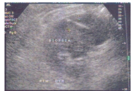
Figure 2. Tumor puncture guided by ultrasound.