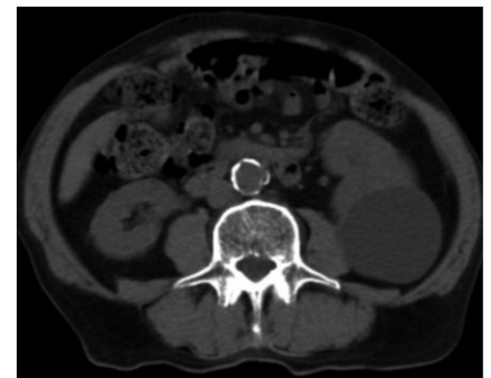
Figure 1. Abdominal computed tomography showing a heterogeneous lesion in the upper pole of the right kidney, measuring 4.2×3.9 cm.

Though surgical resection is the only effective treatment for localized RCC, in some circumstances resection may be used for metastatic disease. 9