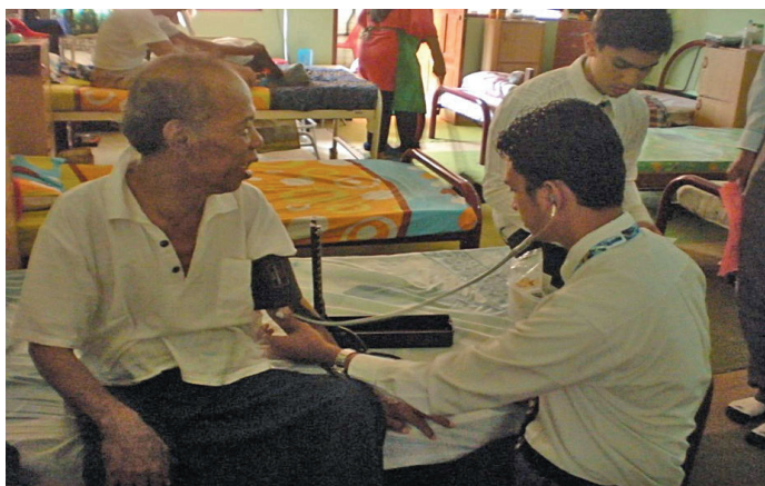
Photo: Older adults living in nursing homes receive regular visitors prior to the pandemic. However, they have been kept in relative isolation once COVID-19 struck, to avoid risks of transmission. From Nik Nairan's collection, used with permission.

A recent study on elder abuse and neglect (EAN) in Hunan province in China reported a prevalence of 15.4%, higher than the pre-pandemic Figure [5]. Another study in the United States found EAN prevalence at 21.3%, a huge leap from figures prior to COVID-19 [6]. Likewise, in a survey among older adults across 17 states and 4 Union Territories in India, 71% believed abuse was on the rise, while 56.1% and 63.7% respondents reported experiencing abuse and neglect, respectively [7]. Robust data from other low- and middle-income countries (LMICs) remains scarce, but circumstantial evidence hints at an overall upward trend of family violence [8,9]. For instance, while little is known about EAN patterns in Malaysia during the pandemic, media and government sources documented a huge increase in the number of hotline calls and requests for assistance by victims of family violence [10]. Even though in Malaysia, the notion of