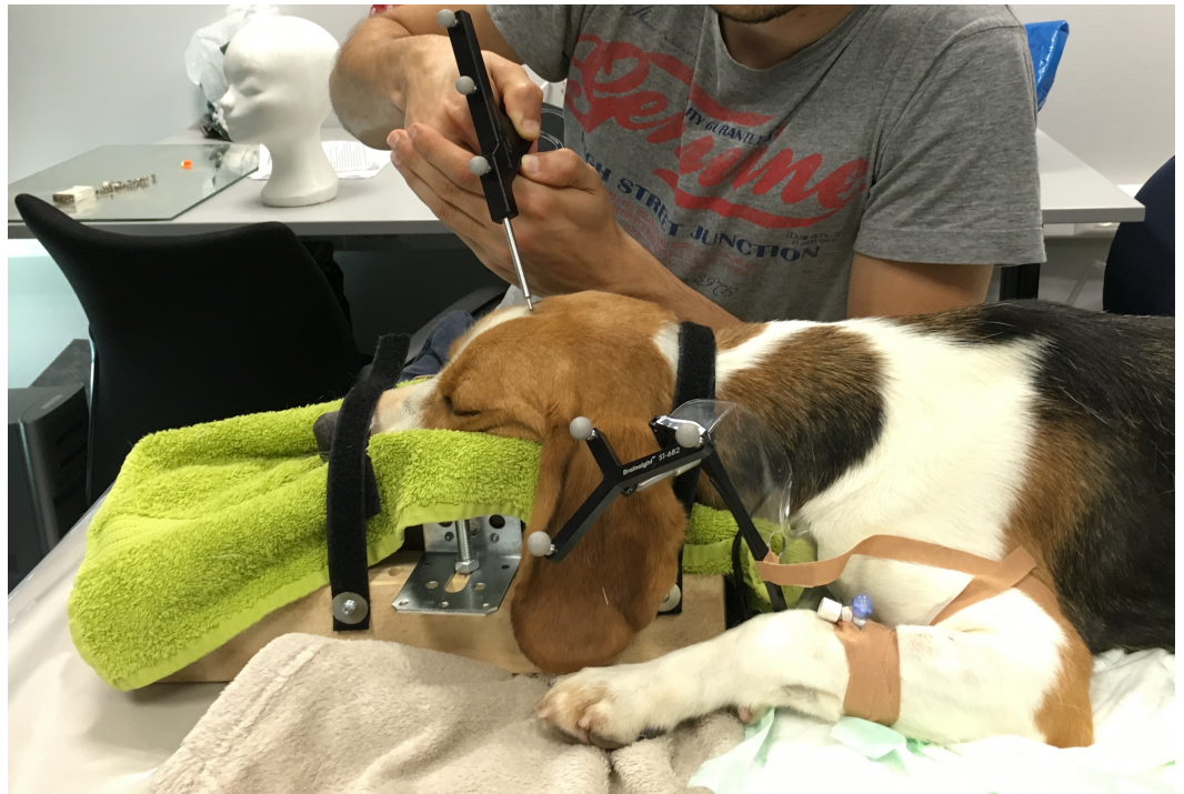
Figure 2 A beagle placed in sternal recumbence, with the head fixed in a self-made mould. The subject tracker is attached to the mould and the dog in the neck region. The infrared camera was placed in front of the dog.

During this recovery phase, the dogs were placed in sternal recumbence, with the head positioned in a self-made mould (Fig. 2). The subject tracker was attached to the neck region in such a way that the infrared camera could detect the marker balls. If needed, the dogs were given dexmedetomidine ( 0,5\text{--}1\ \mu\text{g}/\text{kg} ; IV) to complete the following neuronavigation protocol.