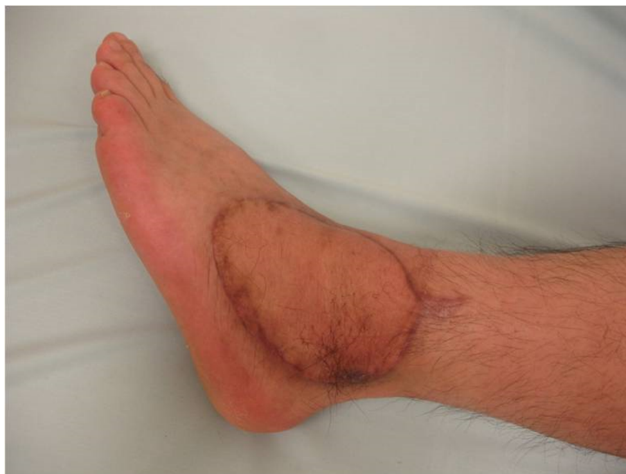
Figure 4 The flap healed well and there was no allodynia 1 year after flap surgery.