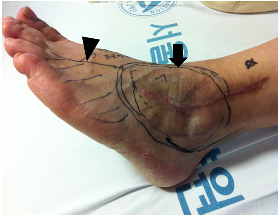
Figure 1 Allodynia (arrow, circle area) of scar tissue area and hypoesthesia (arrow head, oblique line area) on the dorsolateral side of the foot.

In the third surgery, we first widely excised the hypersensitive skin around the scar. The excised skin and subcutaneous tissue measured 13×9 cm. The superficial vein for wrapping the superficial peroneal nerve was harvested from the left inguinal area (Figure 2). The superficial circumflex iliac artery perforator flap was used to cover the skin defect. Microscopic examination of the skin and subcutaneous tissue revealed several nerve