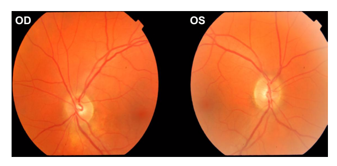
Figure I Fundus exam of a patient with ON on the right eye (OD). Abbreviations: OD, oculus dexter (right); OS, oculus sinister (left); ON, optic neuritis.

valuable prognostic marker. These methods seem sensitive and help to detect visual dysfunction in patients with ON. Recent studies have also demonstrated abnormalities in these modalities even in patients with normal vision ( \geq 20/20).<sup>5</sup> Optic Neuritis Treatment Trial (ONTT) studied the visual function outcome of ON patients over 15 years and visual acuity, contrast sensitivity, and visual field parameters were evaluated.<sup>7,8,9</sup> Among the patients with acute unilateral ON, 79% showed improvement by 3 weeks and 93% improved by 5 weeks.<sup>15,16</sup> Rarely visual recovery was not complete and some patients failed to recover (5%–10%).<sup>7,8,15</sup> However, it was suggested that long-term visual outcome was favorable for the majority of patients even when MS was present.<sup>9</sup>