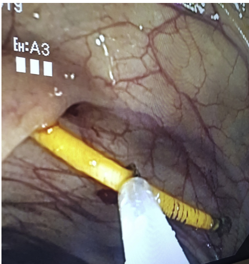
Fig. 2. Attempt to pull out object with endoscopic loop.