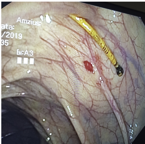
Fig. 1. Object protruding through the intestinal wall.