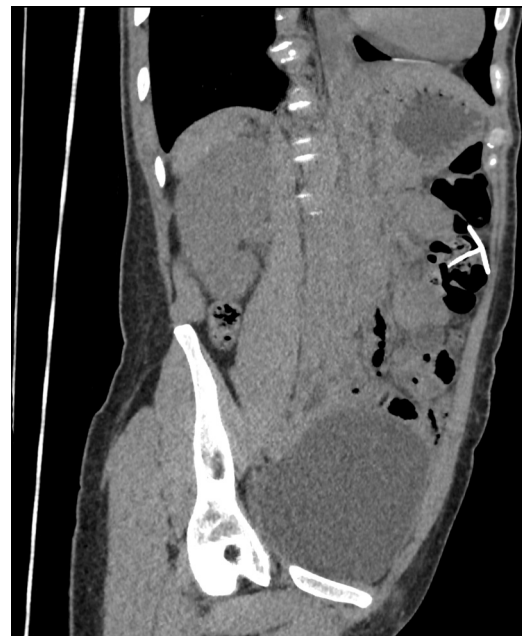
Fig. 3. CT with a foreign body.