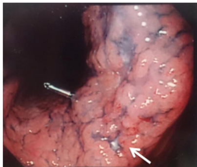
Figure 2: A type 0-IIb tumor located at the lesser curvature of the angle of the stomach on esophagogastroduodenoscopy.

analysis revealed Stage II (type 2, T3, ly2, v0, N0, PM0, DM0) esophageal and Stage I (type 0-IIb, T1, ly0, v0, N0) gastric cancer, with positive horizontal margins of dissection of the gastric cancer. Therefore, as additional treatment, we performed argon-plasma coagulation around the dissected gastric mucosa postoperatively.