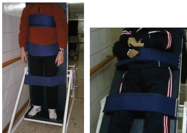
Fig. 1 Tilt table with progressive verticalization