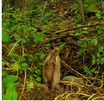
FIGURE 6 Nine-banded Armadillos ( Dasypus novemcinctus ) are born inside burrows and monitoring of these burrows can provide information about the timing of reproduction.