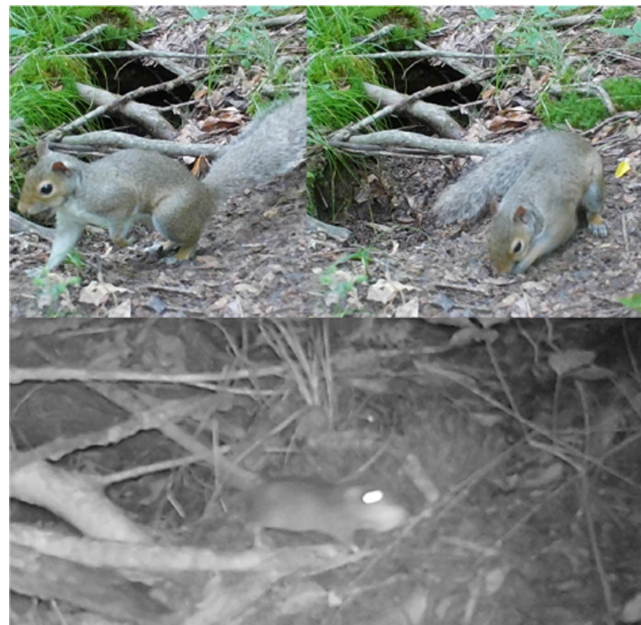
FIGURE 8 Gray Squirrel ( Sciurus carolinensis ) caching acorns and using those food stores at a later date. Also pictured is a mouse who discovered a squirrel cache and took acorn.

and Red-shouldered Hawks ( Buteo lineatus ) capturing prey at the entrances of burrows. In bottomland habitats, frogs, lizards, and snakes were often observed using armadillo burrows, creating