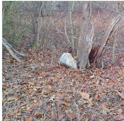
FIGURE 7 Red-shouldered hawks ( Buteo lineatus ) frequently hunted frogs, snakes, and lizards at the entrances to Nine-banded Armadillo ( Dasypus novemcinctus ) burrows.