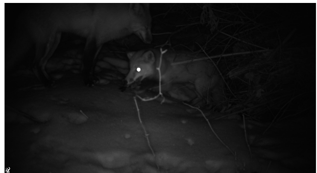
FIGURE 4 Some wildlife, such as these Red Fox ( Vulpes vulpes ) will take over Nine-banded Armadillo ( Dasyus novemcinctus ) burrows, modify their size and structure, and use them as dens. This Red Fox pup, eating an American Robin ( Turdus migratorius ), appears to have been born inside this modified armadillo burrow in the Ozark Mountains of Arkansas.