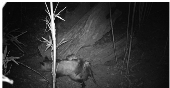
FIGURE 5 Virginia Opossum ( Didelphis virginiana ) appear to use Nine-banded Armadillo ( Dasyus novemcinctus ) burrows as retreat sites when caring for their young during transition stages, a time when both mother and offspring are vulnerable. This Opossum entered an armadillo burrow with a visibly full pouch and emerged one week later with these babies clinging to her back.