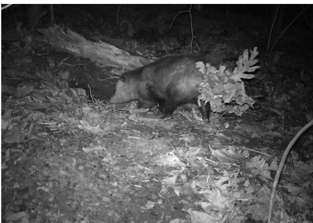
FIGURE 3 A Virginia Opossum ( Didelphis virginiana ) carries a bunch of dried leaves in its prehensile tail. As it enters the Nine-banded Armadillo ( Dasyus novemcinctus ) burrow directly in front of it, the opossum will drop the leaves forming a plug at the entrance of the burrow

over by the Red Fox. Interestingly, the Red Fox used this burrow to give birth to a pup (Figure 4).