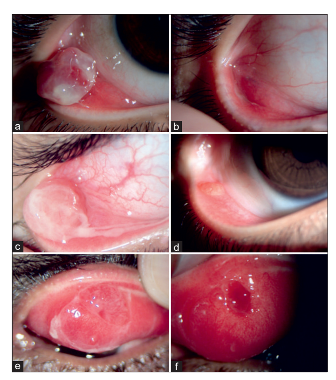
Figure 1: Patients showing excellent response before (a) and after (b); good response before (c) and after (d); satisfactory response before (e) and after (f) treatment

Data were collected and statistically analyzed by using Statistical Package for the Social Sciences (SPSS) version 20 (IBM Corp.,