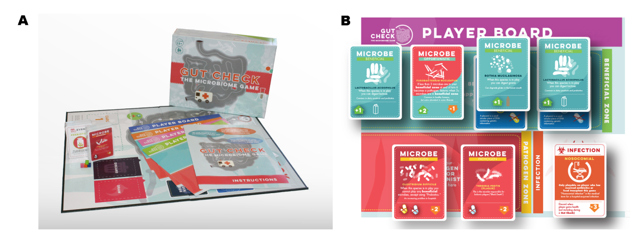
Fig 1. Gut Check: The Microbiome Game (commercial version). (A) Promotional photo of the game showing the game board, instructions, player boards, cards, and box. (B) An example player board set up to have a microbiome containing both beneficial (teal), opportunistic (red and teal), and pathogenic (red) bacteria cards, as well as a unspecified nosocomial infection (orange) card in the lower right. Antibiotic resistance cards (blue) can be seen beneath two of the beneficial bacteria cards.

https://doi.org/10.1371/journal.pbio.2001984.g001