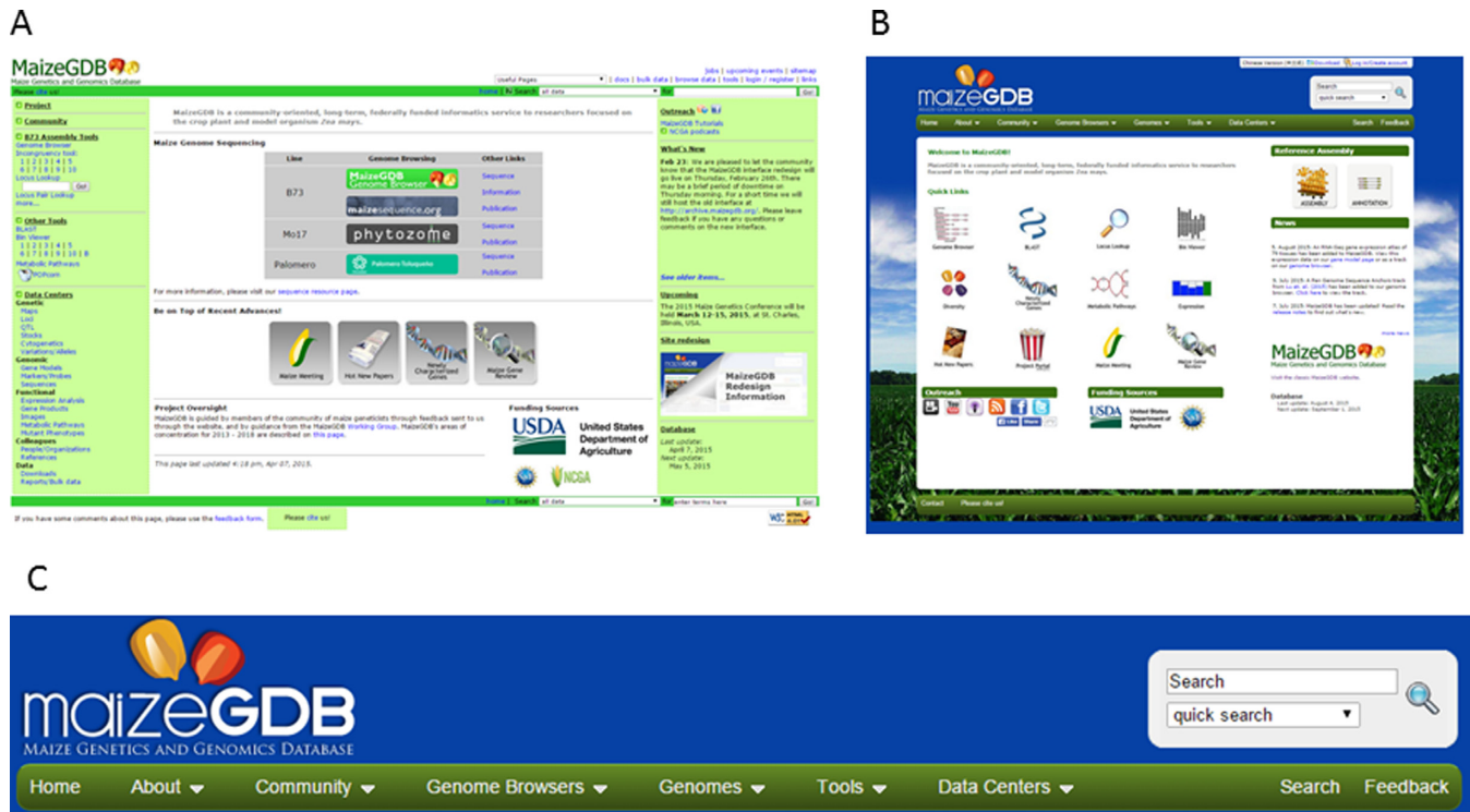
Figure 1. The MaizeGDB web interface before and after the interface redesign. Panel (A) shows the MaizeGDB look-and-feel from 2003 to 2014. The old interface is currently archived and accessible for a short-time via the MaizeGDB website. Panel (B) shows the current web interface (released in March 2015). Webpages, tools, and data centers are organized in a menu within the header of each page (panel C).