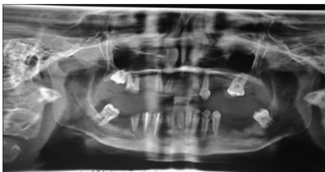
Figure 3: Orthopantomogram: During treatment