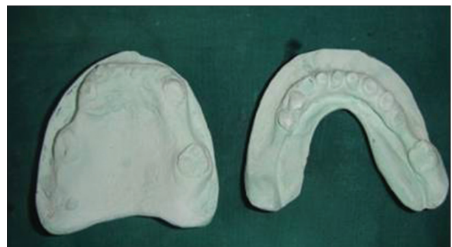
Figure 2: Primary cast