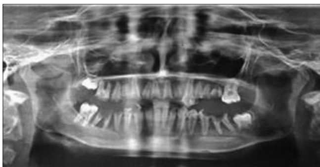
Figure 1: Preoperative orthopantomogram

In this case, the dental erosion was caused by repeated regurgitation of food. We planned for overdenture where we selected 12 13 22 23 31 32 33 34 35 41 42