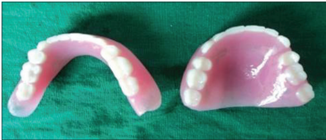
Figure 6: Final finishing of overlay dentures set