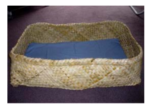
Fig. (2). Wahakura, as used by the Maori (indigenous) communities in New Zealand.

Several communities are re-introducing traditional infant sleep areas as a strategy to increase safety when infants sleep in their parents' beds. In New Zealand, where SUID rates are among the highest for developed countries [8], indigenous SUID rates are more than 4 times those in the European population [50], and deaths associated with bedsharing are common [50], two traditional sleep spaces have been introduced. The wahakura, which is a low-sided (6 inches tall) infant bed woven from flax, was traditionally used in the Maori (indigenous) communities (Fig. 2) and has been actively reintroduced and promoted. It is meant to be used wherever the infant sleeps, but is usually placed in the adult bed next to the parent as a separate infant sleep space within the adult bed. Preliminary results from a randomized controlled trial [51] suggest that rates of use, quantity and quality of maternal sleep, breastfeeding, and head covering