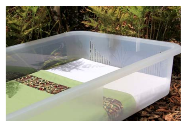
Fig. (3). New Zealand pēpi-pod.

events are similar for the wahakura and a standard bassinet placed next to the parents' bed or in the parents' room. A similar New Zealand product is the pepi-pod ("pepi" is the Maori word for "baby"), a portable plastic container fitted with a firm mattress and used as an infant bed that, like the wahakura, can be placed on the adult bed next to a parent (Fig. 3). The pepi-pod was originally introduced as an emergency infant bed after the 2011 Christchurch earthquakes [52]. The wahakura and pepi-pod are part of a national education program in New Zealand that promotes safe sleep among families at high risk for SUID. The program has been adopted by district health boards as a targeted approach for reducing sudden infant deaths and promoting infant health, especially in regions of New Zealand with more vulnerable populations. Receiving a portable sleep space comes with an expectation that recipients help spread awareness about safe sleep to others, and this has stimulated conversations about safe sleep within the local communities. There is some indication that there is a greater reduction in SUIDs in District health boards with pepi-pod and wahakura programs, compared with those without such programs [53].