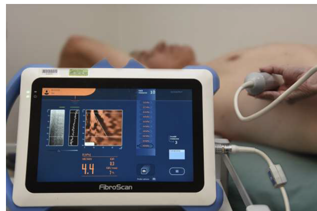
Figure 3 A patient undergoing TE using FibroScan 430 mini (Echosens, Paris, France). TE median of 10 measurements – 4.4 kPa, IQR =0.3. Abbreviations: IQR, interquartile range; TE, transient elastography.

The transducer is positioned over the right 9th, 10th, or 11th intercostal space to measure the elasticity of the right lobe of the liver (Figure 3). Sampling error can be reduced by varying the position of the transducer. 49 However, it is important to note that the final measurement does not represent the entirety of hepatic tissue. The presence of ascites and significant adipose tissue interferes with shear wave propagation, and these are important limitations of TE. In a prospective study of more than 2,000 liver stiffness measurements, TE had a failure rate of 4.5%. 50 In multivariate analysis, increased BMI was the only factor positively associated with failure (although this study excluded patients with