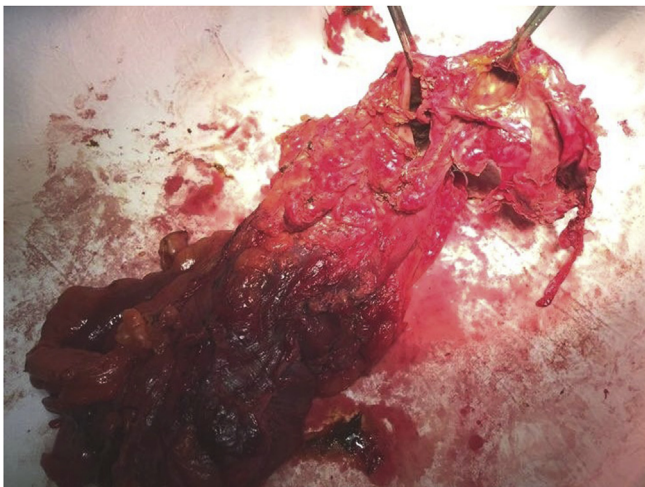
Fig. 3. Right colon with duplication cyst.

regular but thickened walls with post-contrast enhancement, adjacent the hepatic colonic flexure (Fig. 2). Some enlarged lymph nodes were identified. The rest of the colon appeared normal. The patient was optimised for surgery, and a laparoscopic approach was decided. During the explorative laparoscopy, a cyst completely attached to the ascending colon, arising from its mesenteric border was identified. The external surface of the mass was pinkish-grey colour (Fig. 3). Laparotomy conversion was performed due to the impossibility to have a satisfying overview of the mass, and a right hemicolectomy was done. The postoperative course was regular, and the patient was discharged after six days. Pathology reported intestinal duplication cyst, communicating with the normal bowel lumen, with normal mucosa,