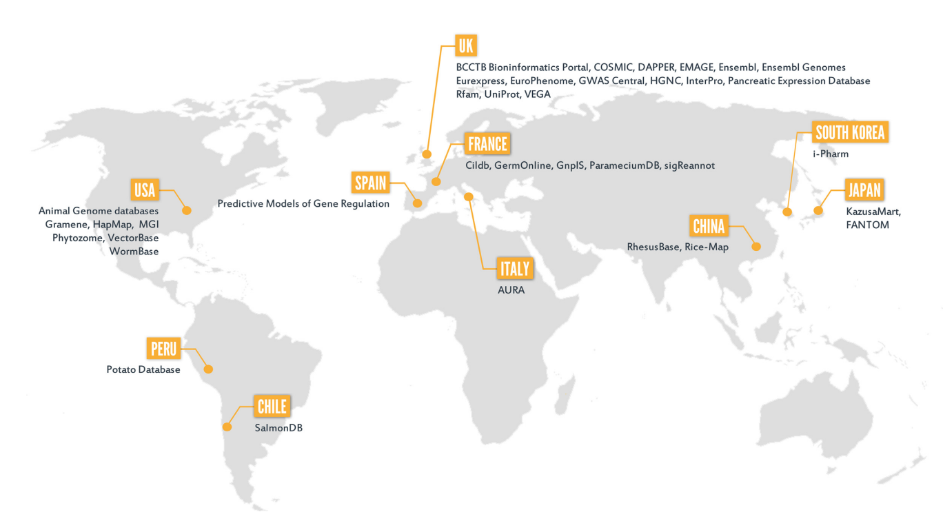
Figure 1. BioMart community databases and their host countries.

ing results from a few existing resources is challenging due to the lack of a complete, up to date catalogue of already existing resources and the necessity of constantly learning how to navigate new query interfaces. A different challenge is faced by collaborating groups of scientists who independently generate or maintain their own data. Such collaborations are seriously hampered by the lack of a simple data management solution that would make it possible to connect their disparate, geographically distributed data sources and present them in a uniform way to other scientists. The BioMart project has been set up to address these challenges.