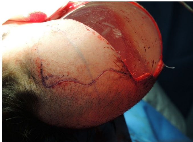
Figure 2: Patient after tissue expansion under forehead skin and reaching a total capacity of 800 cc

Before incision of skin flaps, by transillumination through the expanded forehead skin we became confident that each pedicle had a feeding artery (Figure 4). Then the markings were incised over to elevate flaps. The flap which was used to cover the future columella and the tip of a longitudinal skin strip was de-epithelialized on both sides (Figure 3). The other flap (reverse one) was used to cover the inside of the nose. Then the nasal stent was removed. Simultaneously a second team made a 4 cm incision on the right side of the chest wall over the seventh and eighth ribs to harvest a 6 cm block of rib bone