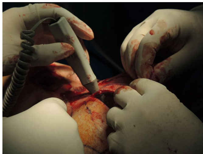
Figure 4: Finding feeding arteries on pedicles by transillumination

in the midline on the frontal bone was fixed as a cantilever graft. The tip of the nose was reshaped with cartilage grafts as well. To create an arc of the alae, cartilage was fixed between flaps. Subsequently, the cartilage harvested from the rib which was placed as a columella between the dorsum and maxilla was sutured by nylon 5.0 to reproduce the final shape of the nose. On both sides, the new cartilaginous septum was covered with the de-epithelialized skin flap. A frontal flap was used for the mucous layer and the other one was applied as the outer cutaneous layer. The flap was sutured all around and infolded at the site of the alae. The donor area of the frontal flap was closed completely by primary approximation