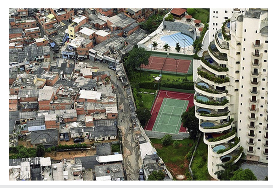
Fig. 2. A startling contrast: slums adjacent to high-income apartment complexes. Favela de Paraisópolis. The favela (shanti town) on the left is ironically called Paraisópolis (Paradise City). Paraisópolis is situated in the center of metropolitan São Paulo, bordering on middle-income and upper-income residential areas. It lies in a large steep-sided ravine and has a physically challenging geography. It is an extremely densely populated area, with an estimated population of 80,000 to 100,000 people.

of roads, schools, and health facilities. In the most extreme cases, the governments may demolish slum areas as a way of forcing these large populations to move elsewhere. This cycle leads to less investment of the slum dwellers in improving their own conditions, as all could be eliminated by someone else at any time without notice. All of these factors work synergistically to affect multiple facets of child health and development. This is described in detail from both short-term and long-term perspectives.