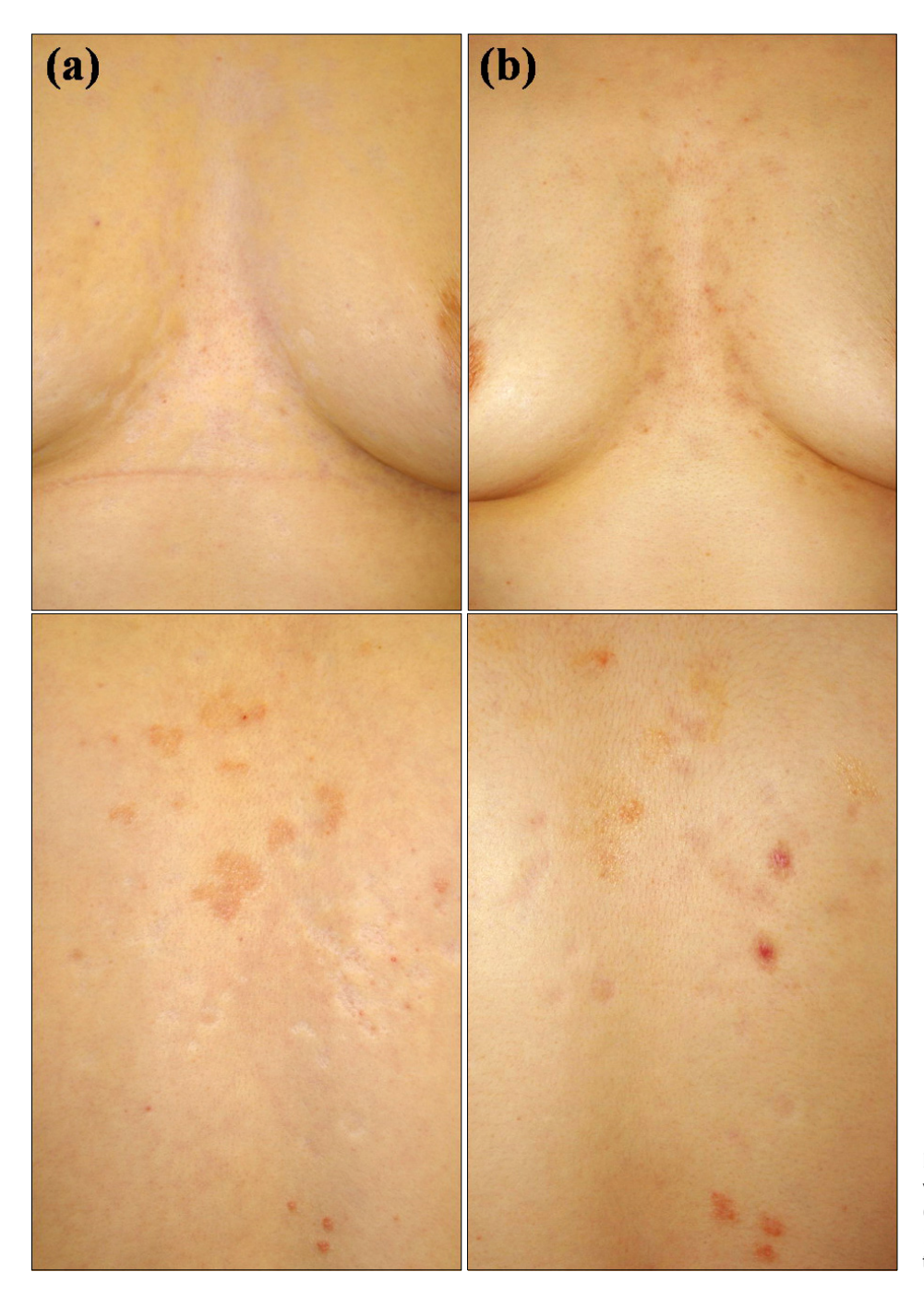
Fig. 3. After a three-week treatment with oral doxycycline 200 mg/day (b), the depths of the lesions were improved, compared with those of the pre-treatment state (a).

retrospective evaluation of 25 patients treated with either oral penicillin (2 million IU/d) or oral tetracycline (500 mg three times/day) for 2~3 weeks showed clinical improvement, with no new active lesions in 20 patients (80%). The same study also showed no progressive disease in four of six patients who did not receive treatment<sup>6</sup>.