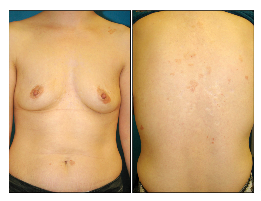
Fig. 1. Variably-sized round- to oval-shaped, hypopigmented patches on the intermammarial area and on the back, with preexisting psoriatic lesions. The lesions were depressed below the level of the surrounding skin and coalesced to form large depressed plaques.