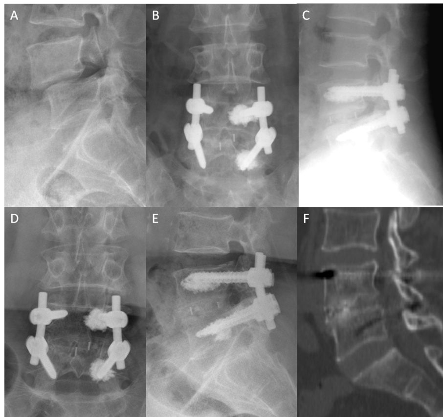
Fig. 2 A 65-year-old female diagnosed with spondylolisthesis at the L4 vertebral body with osteoporosis ( T = -3.2 ). a Preoperative lateral X-ray showing grade I lumbar spondylolisthesis. b–c Unilateral PMMA-augmented CPSs are used for spinal fixation. Immediate postoperative radiographs showing reconstruction for spondylolisthesis without PMMA leakage. d–e CPSs are observed in place after 49 months of surgery. f CT scan showing that bony fusion was achieved

groups were significantly restored after surgery ( P < 0.05 ). The intervertebral disk height and Taillard index were not statistically significant as time went by ( P = 0.672 ). Moreover, there was no significant difference in correction loss between the two groups at the last follow-up ( P = 0.289 ) (Table 4). Furthermore, the displacement distances ( X and Y ) after surgery and at the last follow-up were not significantly different between the two groups ( P > 0.05 ). The absolute values of the