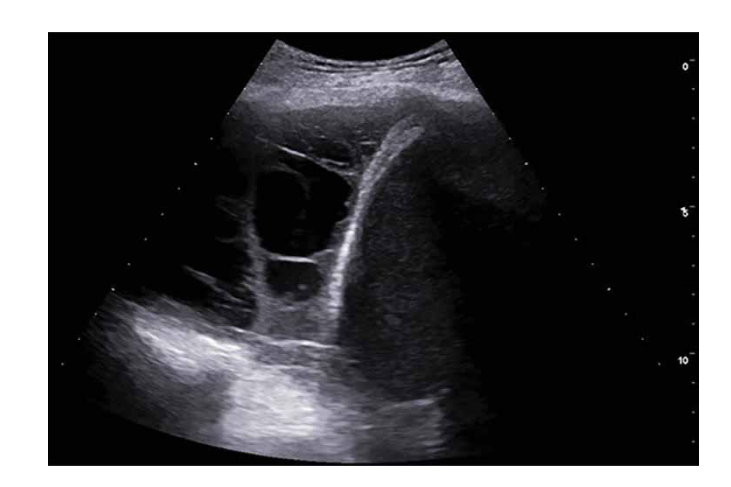
FIGURE 1 Right thoracic cavity ultrasound scan showing echogenic effusion with coarse septations.

of pleural infection and need for drainage, but need further prospective studies before being recommended for use in clinical practice.