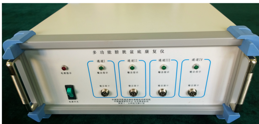
Figure 1 The picture of the Bladder-Pelvic Stimulator (I).

cystoplasty. In our previous research [1], we showed that the most common problem within 6 months post-operatively was incontinence, which might have resulted from the weakened function of the sphincter post-operatively. The presence of an indwelling urethral catheter for a long period could contribute to sphincter weakness because the maximal urethral pressure at rest was significantly decreased during the 6-month follow-up examination compared with the pre-operative pressure. Automatic contraction of the intestinal reservoir could also lead to pressure increase and incontinence. The residual detrusor also may maintain DO post-operatively. New bladder wall edema can result in