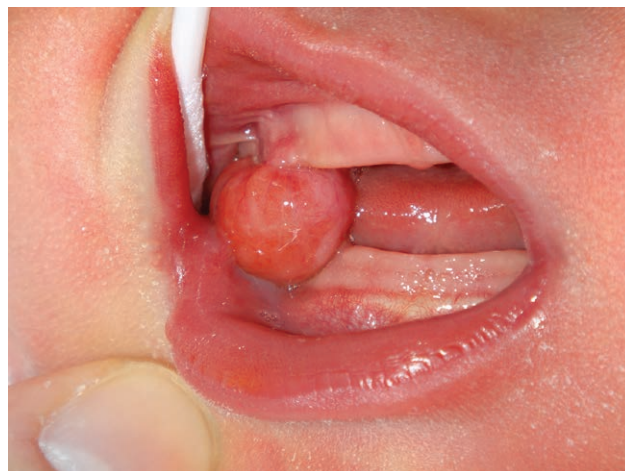
Fig. 1. Intraoral photograph in 1-day-old baby girl. An approximately 15×15 mm pedunculated mass with a healthy color attached to maxillary alveolar ridge was observed in the right maxillary deciduous canine or first molar region.

and (2) a spontaneous regression of congenital epulis has been reported. 2 Eventually, the surgical excision was performed at 4 months, although interestingly the mass was shrunk from 15×15 mm to 5×8 mm. The histogenesis is still unknown. 1-5 In this case, the lesion showed weakly positive for CD68, which is a rare histopathological finding. However, some cases with CD68 positive are reported. 3,4 Vered et al. 5 have reported that immunohistological analysis using the broad panel of antibodies that characterize different tissues confirms no particular cell type for the histogenetic origin of congenital granular cell epulis. However, the lesion will be of non-neoplastic nature because the clinical course is characterized by