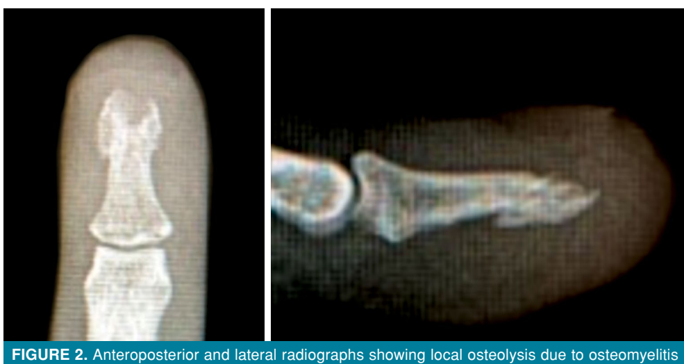
of distal phalanx.

showed an abundant number of neutrophils (polymorphonuclear neutrophil leukocytes) with no microorganism. Bacterial and fungal cultures were incubated and regular-shaped colonies with white to cream color were seen at 72 h of incubation in the blood agar and sabouraud dextrose agar. Using the matrix-assisted laser desorption/ionization time of flight mass spectrometry (MALDI-TOF-MS; VITEK<sup>®</sup>; bioMérieux Diagnostics, France), C. lusitaniae was isolated. The antifungal susceptibility was tested via the VITEK<sup>®</sup> 2 (bioMérieux Diagnostics, France) antimicrobial susceptibility testing. The culture analysis showed production of C. lusitaniae and the pathological examination result was reported as superficial tissue characterized by parakeratosis and squamous hyperplasia. Postoperative laboratory testing showed normal ESR and CRP levels with a