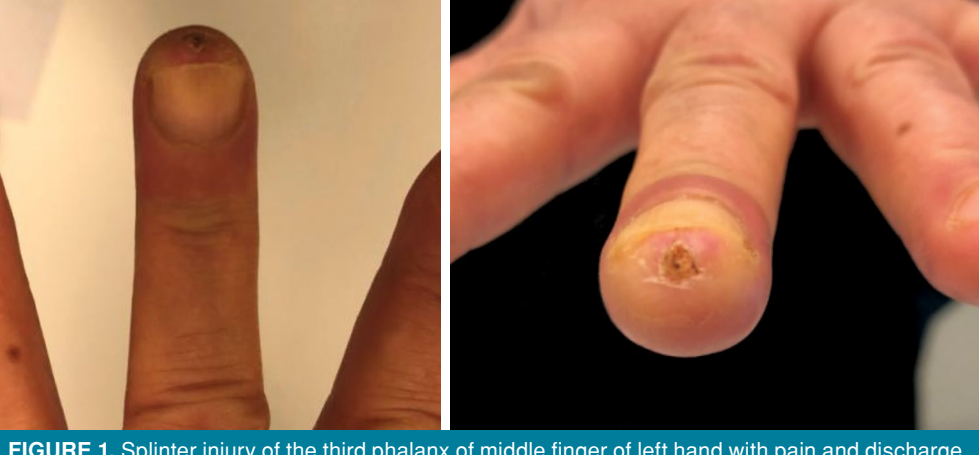
FIGURE 1. Splinter injury of the third phalanx of middle finger of left hand with pain and discharge.

sedimentation rate (ESR) 17 (0-20) mm/h, and C-reactive protein (CRP) 0.000785 (0-0,005) g/L. Physical examination and radiographs revealed osteomyelitis of the distal phalanx (Figure 2). Severe tenderness over the distal volar pulp on palpation and minimal discharge from the entry site of the splinter. Surgical treatment was decided, and a written informed consent was obtained from the patient.